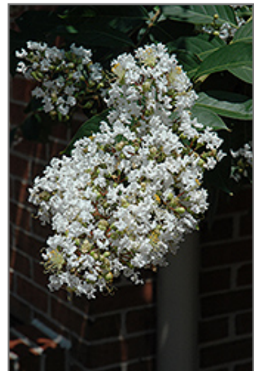
Natchez Crapemyrtle flowers

This is a relatively low maintenance tree, and is best pruned in late winter once the threat of extreme cold has passed. Deer don't particularly care for this plant and will usually leave it alone in favor of tastier treats. It has no significant negative characteristics.