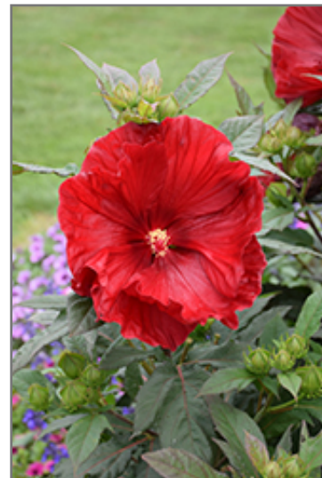
Summerific Cranberry Crush Hibiscus flowers