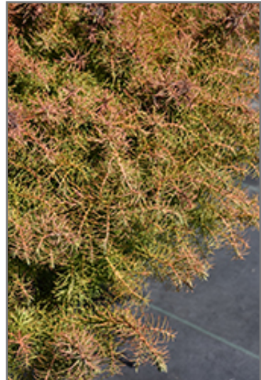
Mushroom Japanese Cedar foliage