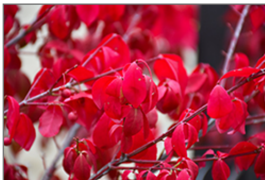
Rudy Haag Burning Bush in fall