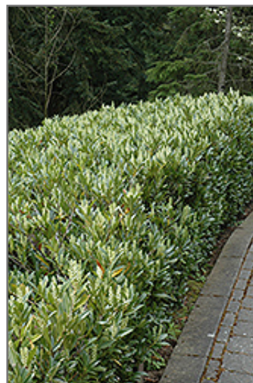
Otto Luyken Dwarf Cherry Laurel in bloom