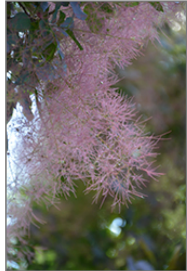
Royal Purple Smokebush flowers

This shrub should only be grown in full sunlight. It is very adaptable to both dry and moist locations, and should do just fine under average home landscape conditions. It is not particular as to soil type or pH. It is highly tolerant of urban pollution and will even thrive in inner city environments, and will benefit from being planted in a relatively sheltered location. This is a selected variety of a species not originally from North America.