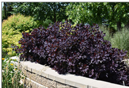
Royal Purple Smokebush