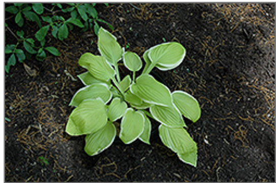
St. Elmo's Fire Hosta