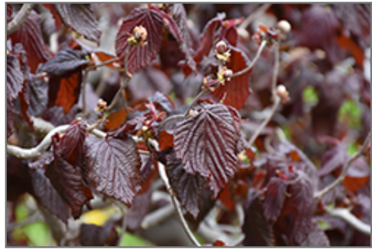
Red Majestic Corkscrew Hazelnut foliage

This shrub does best in full sun to partial shade. It is very adaptable to both dry and moist locations, and should do just fine under average home landscape conditions. It is not particular as to soil type or pH. It is highly tolerant of urban pollution and will even thrive in inner city environments. This is a selected variety of a species not originally from North America.