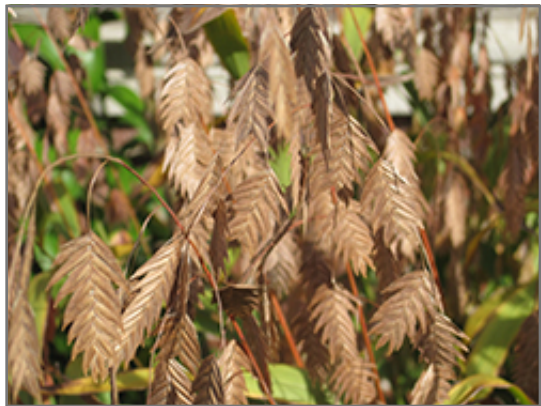
Northern Sea Oats fruit

Northern Sea Oats will grow to be about 4 feet tall at maturity, with a spread of 30 inches. Its foliage tends to remain dense right to the ground, not requiring facer plants in front. It grows at a medium rate, and under ideal conditions can be expected to live for approximately 10 years. As an herbaceous perennial, this plant will usually die back to the crown each winter, and will regrow from the base each spring. Be careful not to disturb the crown in late winter when it may not be readily seen!