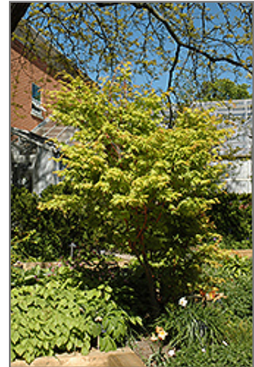
Coral Bark Japanese Maple