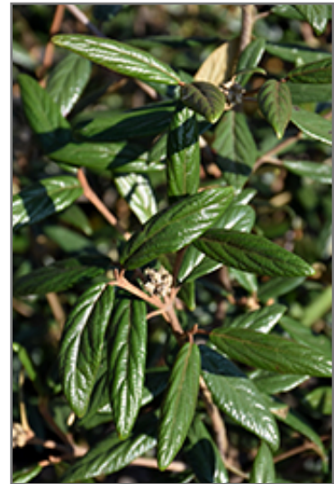
Prague Viburnum foliage

This shrub performs well in both full sun and full shade. It prefers to grow in average to moist conditions, and shouldn't be allowed to dry out. It is not particular as to soil type or pH. It is highly tolerant of urban pollution and will even thrive in inner city environments. This particular variety is an interspecific hybrid.