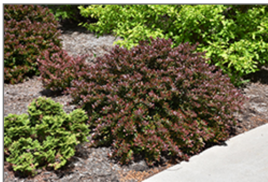
Concorde Japanese Barberry

Concorde Japanese Barberry is recommended for the following landscape applications;