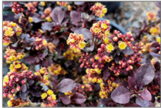
Concorde Japanese Barberry flowers

Concorde Japanese Barberry will grow to be about 18 inches tall at maturity, with a spread of 24 inches. It tends to fill out right to the ground and therefore doesn't necessarily require facer plants in front. It grows at a slow rate, and under ideal conditions can be expected to live for approximately 20 years.