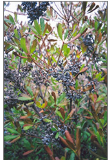
Northern Bayberry fruit

This shrub does best in full sun to partial shade. It does best in average to evenly moist conditions, but will not tolerate standing water. It is very fussy about its soil conditions and must have sandy, acidic soils to ensure success, and is subject to chlorosis (yellowing) of the foliage in alkaline soils, and is able to handle environmental salt. It is highly tolerant of urban pollution and will even thrive in inner city environments. This species is native to parts of North America.