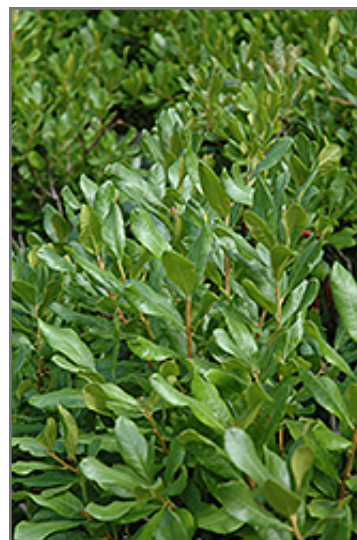
Northern Bayberry foliage