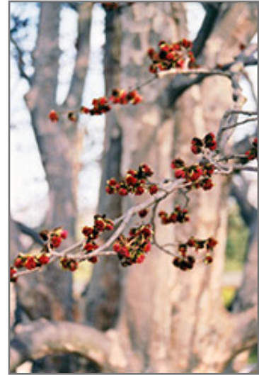
Persian Parrotia flowers

This tree should only be grown in full sunlight. It is very adaptable to both dry and moist locations, and should do just fine under average home landscape conditions. It is not particular as to soil type or pH. It is highly tolerant of urban pollution and will even thrive in inner city environments. This species is not originally from North America.