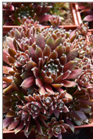
Chick Charms Cinnamon Starburst Hens And Chicks