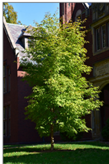
Three Flowered Maple