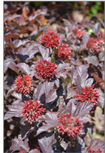
Ginger Wine Ninebark flower buds

This is a relatively low maintenance shrub, and can be pruned at anytime. It has no significant negative characteristics.