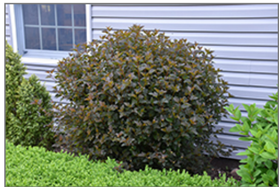
Ginger Wine Ninebark