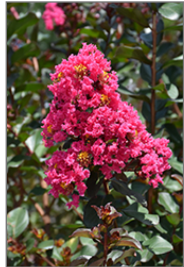
Pink Velour Crapemyrtle flowers