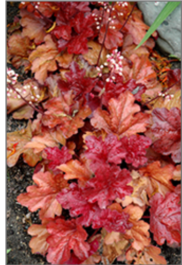
Fire Alarm Coral Bells

Fire Alarm Coral Bells is recommended for the following landscape applications;