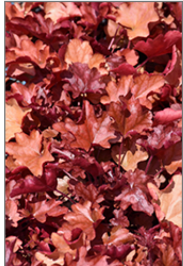
Fire Alarm Coral Bells foliage