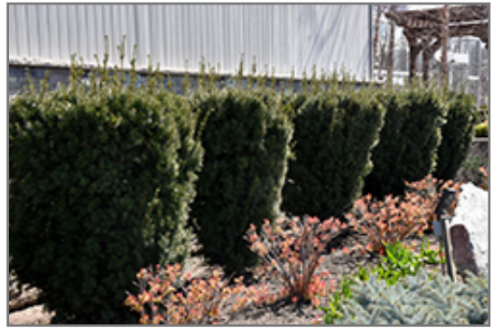
Hicks Yew

This shrub performs well in both full sun and full shade. However, you may want to keep it away from hot, dry locations that receive direct afternoon sun or which get reflected sunlight, such as against the south side of a white wall. It does best in average to evenly moist conditions, but will not tolerate standing water. It is not particular as to soil type or pH. It is highly tolerant of urban pollution and will even thrive in inner city environments, and will benefit from being planted in a relatively sheltered location. Consider applying a thick mulch around the root zone in winter to protect it in exposed locations or colder microclimates. This particular variety is an interspecific hybrid, and parts of it are known to be toxic to humans and animals, so care should be exercised in planting it around children and pets.