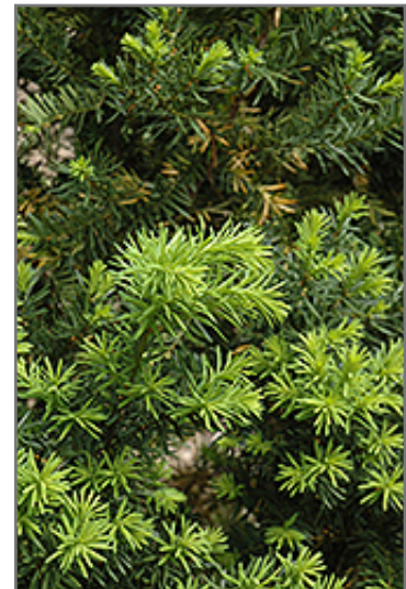
Hicks Yew foliage