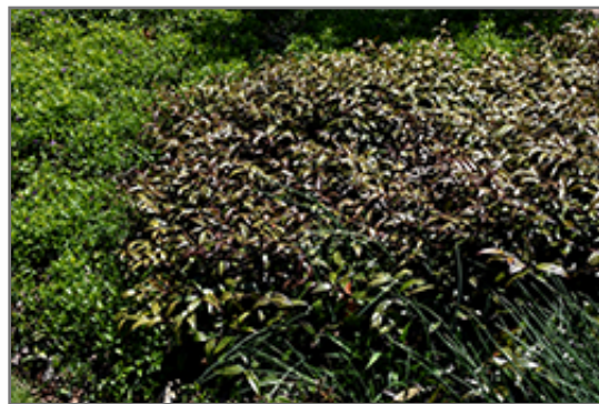
Scarletta Fetterbush