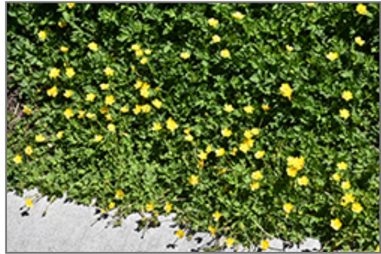
Barren Strawberry in bloom