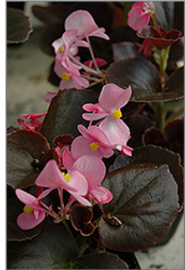
Cocktail Gin Begonia flowers