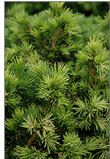
Tompa Dwarf Spruce foliage