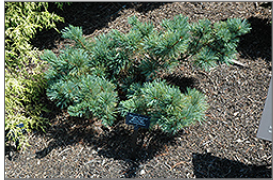
Blue Dwarf Japanese Stone Pine

Blue Dwarf Japanese Stone Pine is recommended for the following landscape applications;