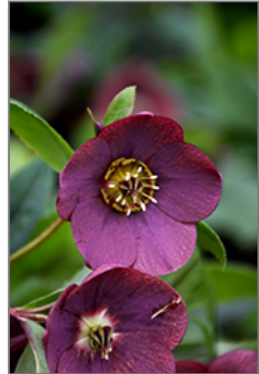
Honeymoon Rome In Red Hellebore flowers

Honeymoon Rome In Red Hellebore is recommended for the following landscape applications;