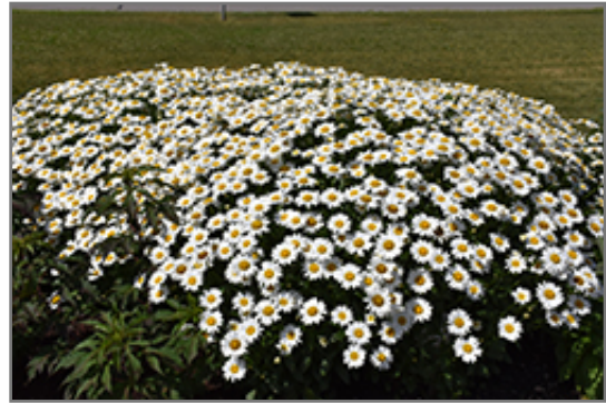
Becky Shasta Daisy in bloom