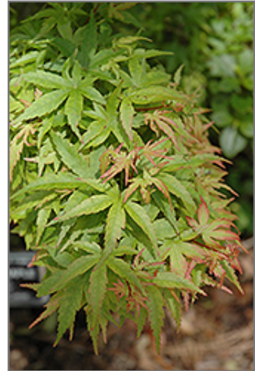
Sharp's Pygmy Japanese Maple foliage