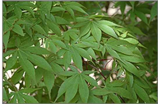
Osakazuki Japanese Maple foliage

This is a relatively low maintenance tree, and should only be pruned in summer after the leaves have fully developed, as it may 'bleed' sap if pruned in late winter or early spring. It has no significant negative characteristics.