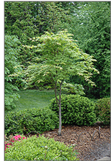
Osakazuki Japanese Maple