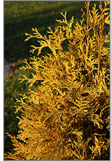
Yellow Ribbon Arborvitae in fall

This shrub does best in full sun to partial shade. It prefers to grow in average to moist conditions, and shouldn't be allowed to dry out. It is not particular as to soil type or pH. It is somewhat tolerant of urban pollution, and will benefit from being planted in a relatively sheltered location. Consider applying a thick mulch around the root zone in winter to protect it in exposed locations or colder microclimates. This is a selection of a native North American species.