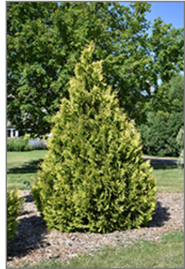
Yellow Ribbon Arborvitae