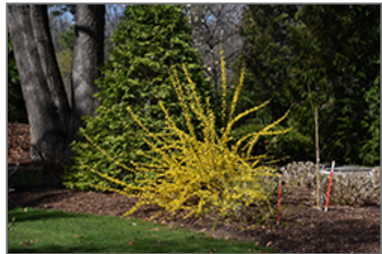
Show Off Forsythia in bloom