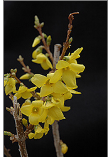
Show Off Forsythia flowers

Show Off Forsythia makes a fine choice for the outdoor landscape, but it is also well-suited for use in outdoor pots and containers. With its upright habit of growth, it is best suited for use as a 'thriller' in the 'spiller-thriller-filler' container combination; plant it near the center of the pot, surrounded by smaller plants and those that spill over the edges. It is even sizeable enough that it can be grown alone in a suitable container. Note that when grown in a container, it may not perform exactly as indicated on the tag - this is to be expected. Also note that when growing plants in outdoor containers and baskets, they may require more frequent waterings than they would in the yard or garden.