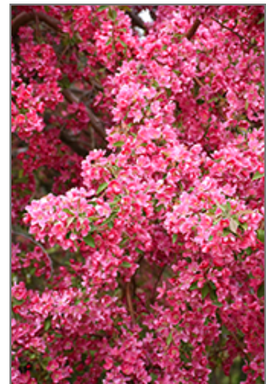
Prairifire Flowering Crab flowers