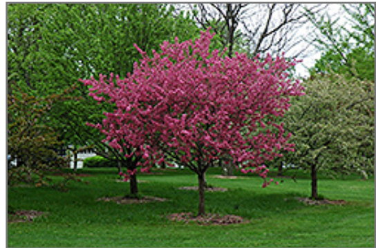
Prairifire Flowering Crab in bloom

This tree will require occasional maintenance and upkeep, and is best pruned in late winter once the threat of extreme cold has passed. It has no significant negative characteristics.