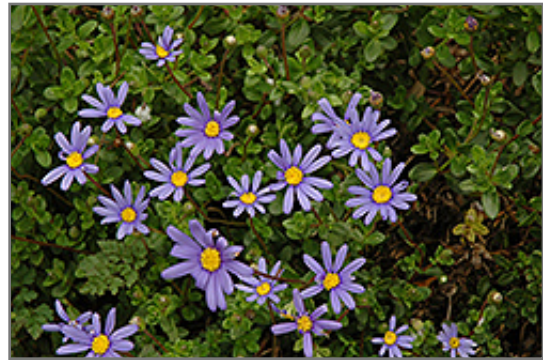
Blue Daisy flowers