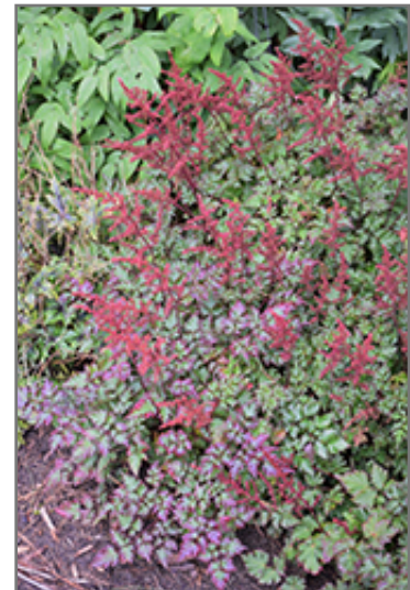
Delft Lace Astilbe in bloom