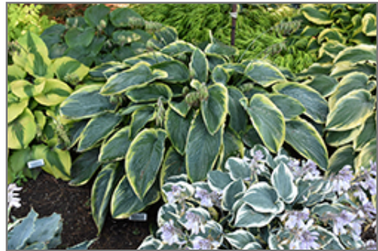
Shadowland Wu-La-La Hosta

This is a relatively low maintenance plant, and is best cleaned up in early spring before it resumes active growth for the season. Gardeners should be aware of the following characteristic(s) that may warrant special consideration;