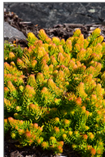
Angelina Stonecrop foliage