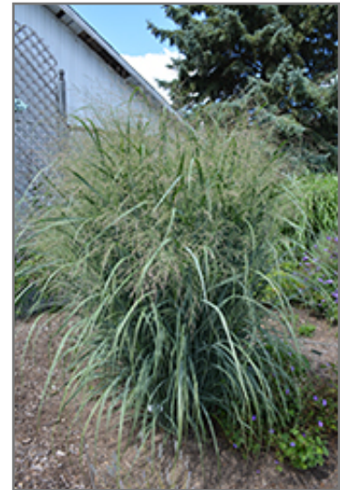
Northwind Switch Grass in bloom

This plant does best in full sun to partial shade. It is very adaptable to both dry and moist locations, and should do just fine under typical garden conditions. It is considered to be drought-tolerant, and thus makes an ideal choice for a low-water garden or xeriscape application. It is not particular as to soil type, but has a definite preference for alkaline soils, and is able to handle environmental salt. It is somewhat tolerant of urban pollution. This is a selection of a native North American species. It can be propagated by division; however, as a cultivated variety, be aware that it may be subject to certain restrictions or prohibitions on propagation.