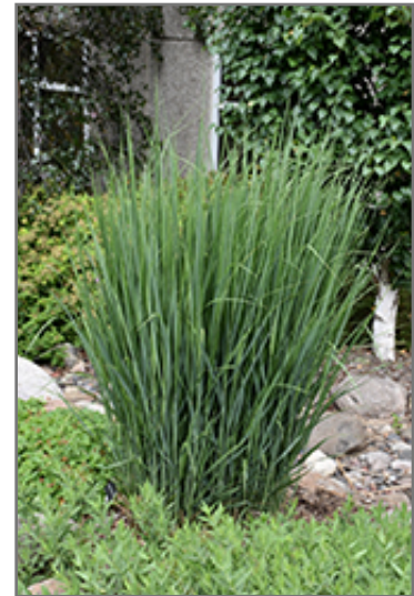
Northwind Switch Grass