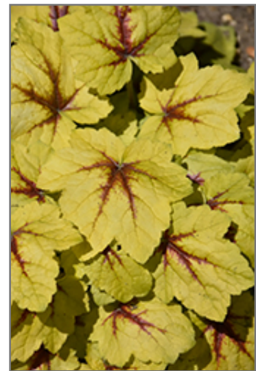
Catching Fire Foamy Bells foliage