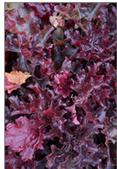
Dolce Cherry Truffles Coral Bells foliage