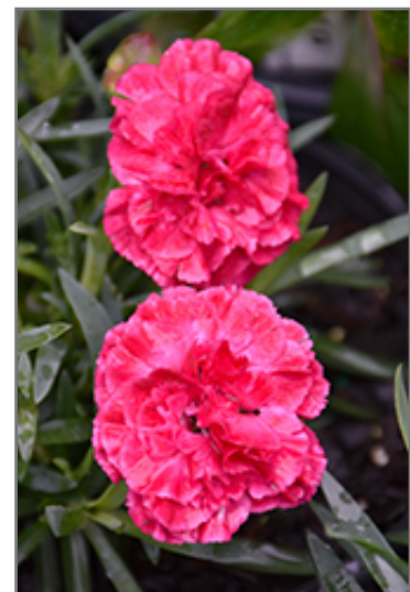
Fruit Punch Raspberry Ruffles Pinks flowers