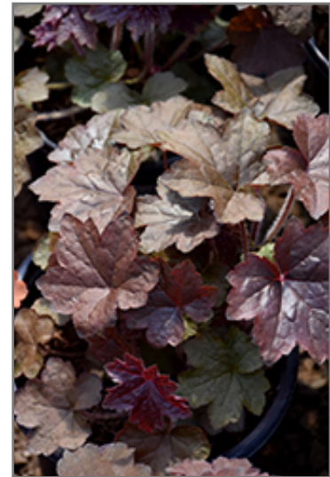
Palace Purple Coral Bells foliage

Palace Purple Coral Bells is recommended for the following landscape applications;