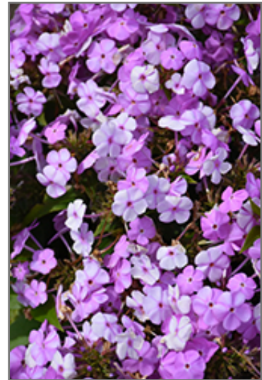
Fashionably Early Princess Garden Phlox flowers