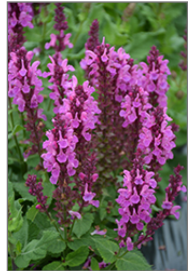
Rose Marvel Meadow Sage flowers

Rose Marvel Meadow Sage is recommended for the following landscape applications;