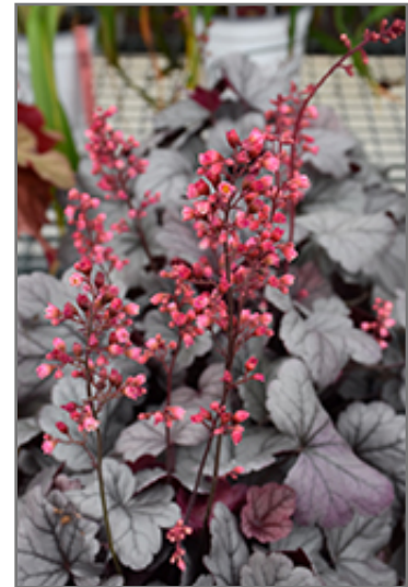
Dolce Silver Gumdrop Coral Bells flowers

This is a relatively low maintenance plant, and should be cut back in late fall in preparation for winter. It is a good choice for attracting hummingbirds to your yard. It has no significant negative characteristics.