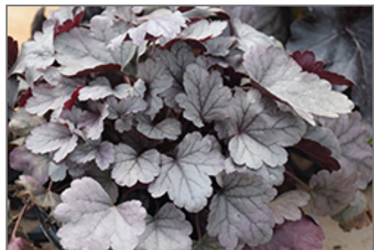
Dolce Silver Gumdrop Coral Bells foliage