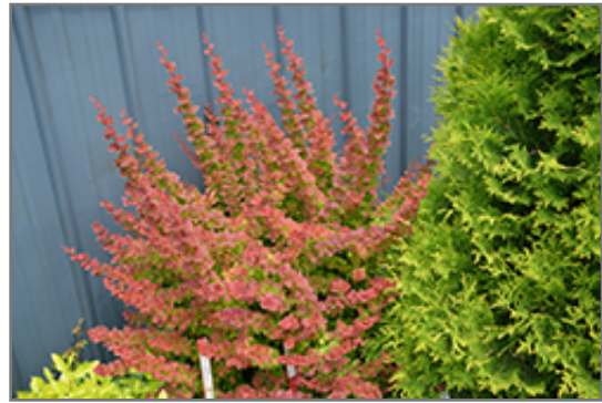
Sunjoy Tangelo Japanese Barberry

Sunjoy Tangelo Japanese Barberry will grow to be about 4 feet tall at maturity, with a spread of 4 feet. It tends to fill out right to the ground and therefore doesn't necessarily require facer plants in front. It grows at a medium rate, and under ideal conditions can be expected to live for approximately 20 years.