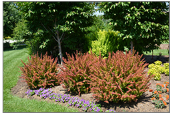
Sunjoy Tangelo Japanese Barberry

Sunjoy Tangelo Japanese Barberry is recommended for the following landscape applications;