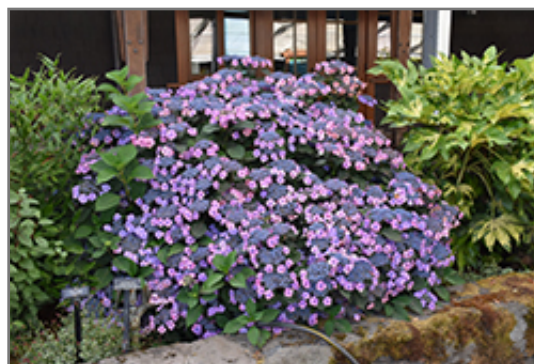
Tuff Stuff Hydrangea in bloom