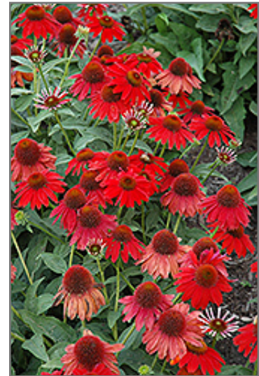
Sombbrero Salsa Red Coneflower flowers

Sombbrero Salsa Red Coneflower is recommended for the following landscape applications;