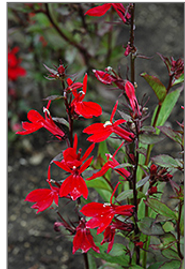
Fan Scarlet Cardinal Flower flowers