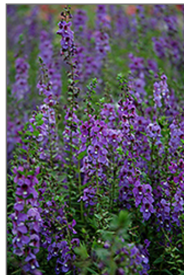
Serena Blue Angelonia flowers

Serena Blue Angelonia is recommended for the following landscape applications;