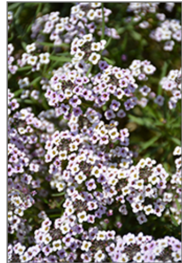
Blushing Princess Sweet Alyssum flowers

This plant will require occasional maintenance and upkeep, and should not require much pruning, except when necessary, such as to remove dieback. It is a good choice for attracting bees and butterflies to your yard, but is not particularly attractive to deer who tend to leave it alone in favor of tastier treats. It has no significant negative characteristics.