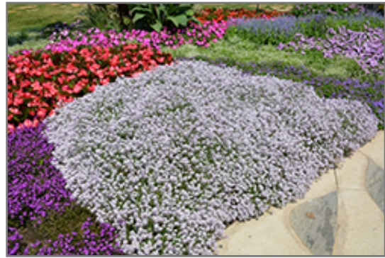
Blushing Princess Sweet Alyssum in bloom

Blushing Princess Sweet Alyssum will grow to be only 6 inches tall at maturity, with a spread of 24 inches. When grown in masses or used as a bedding plant, individual plants should be spaced approximately 20 inches apart. Its foliage tends to remain low and dense right to the ground. This fast-growing annual will normally live for one full growing season, needing replacement the following year.